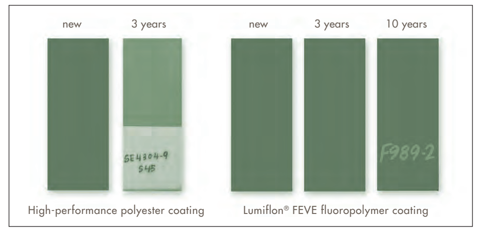
FIGURE 1: COMPARISON OF DURABILITY BETWEEN HIGH-PERFORMANCE POLYESTER AND LUMIFLON® FEVE FLUOROPOLYMER COATINGS

For these reasons, ALPOLIC<sup>®</sup> materials may help your building earn LEED Credits ID 1.1 – 1.4. For details, visit www.alpolic-americas.com/en/LEED.