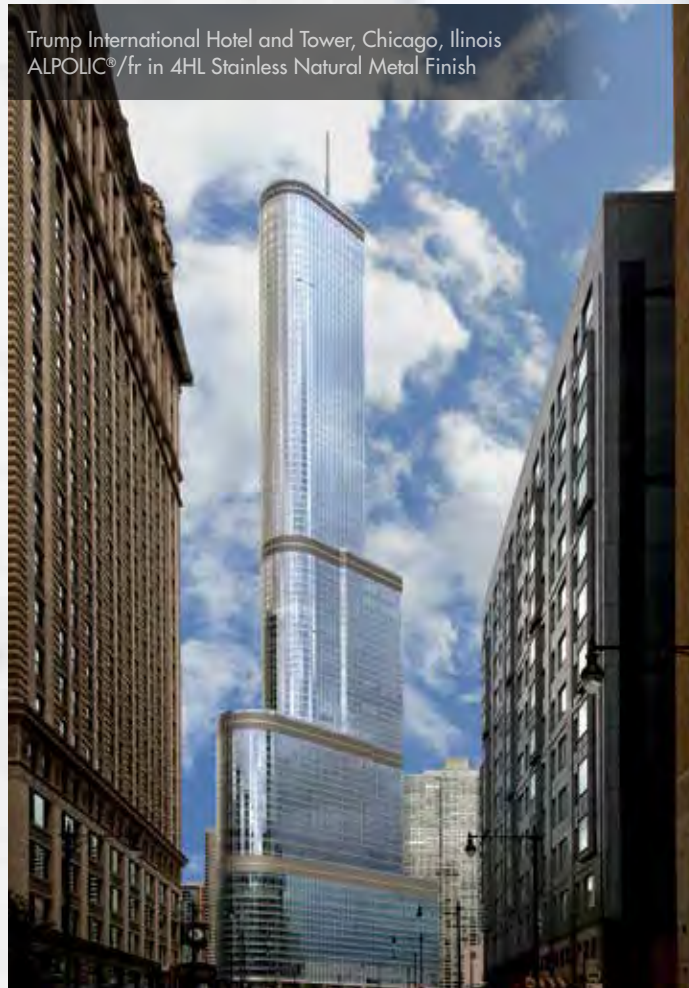
Trump International Hotel and Tower, Chicago, Illinois ALPOLIC®/fr in 4HL Stainless Natural Metal Finish

Your project's potential. Your technical requirements. Your practical needs. We understand your ideal. Let's make it real. Let's build.