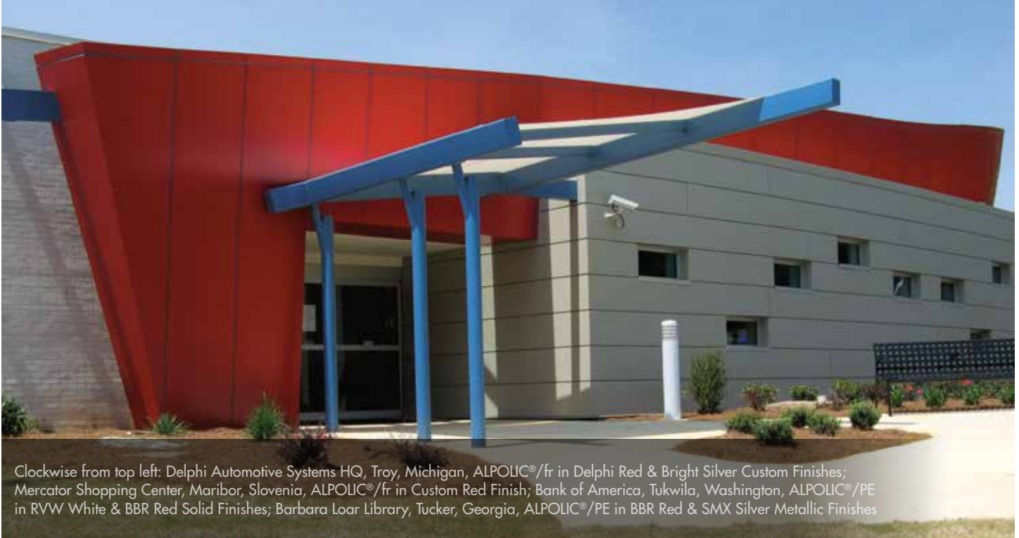
Clockwise from top left: Delphi Automotive Systems HQ, Troy, Michigan, ALPOLIC®/fr in Delphi Red & Bright Silver Custom Finishes; Mercator Shopping Center, Maribor, Slovenia, ALPOLIC®/fr in Custom Red Finish; Bank of America, Tukwila, Washington, ALPOLIC®/PE in RVW White & BBR Red Solid Finishes; Barbara Loar Library, Tucker, Georgia, ALPOLIC®/PE in BBR Red & SMX Silver Metallic Finishes