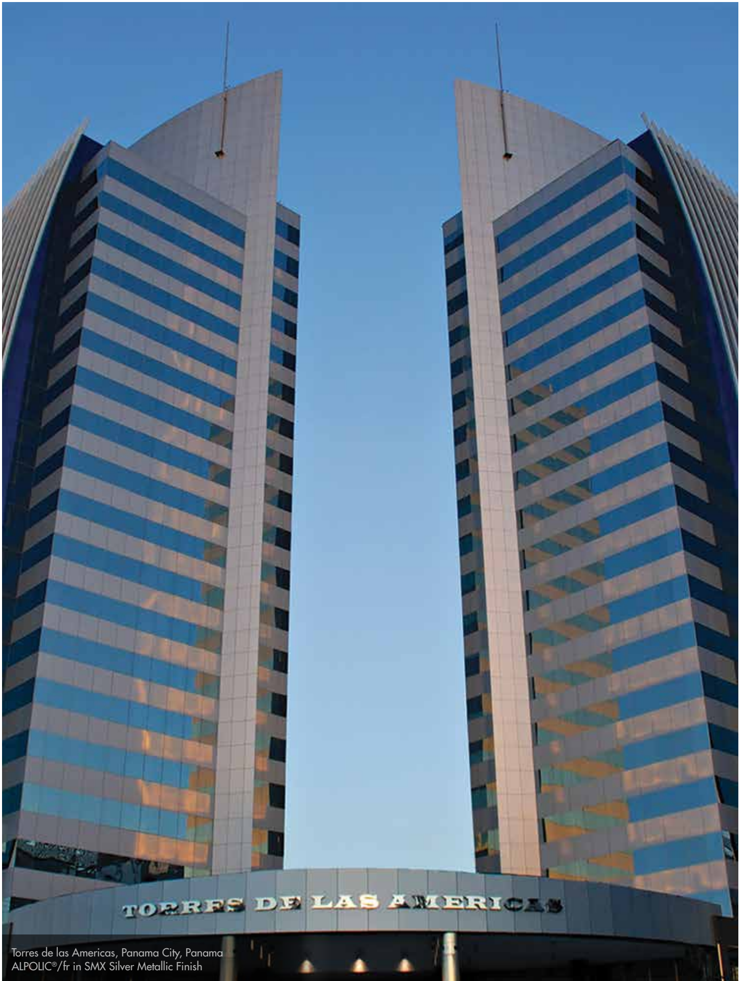
Torres de las Americas, Panama City, Panama ALPOLIC®/fr in SMX Silver Metallic Finish